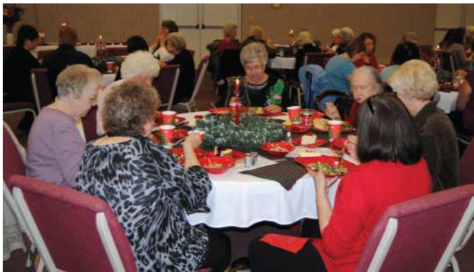
Enjoying the meal.