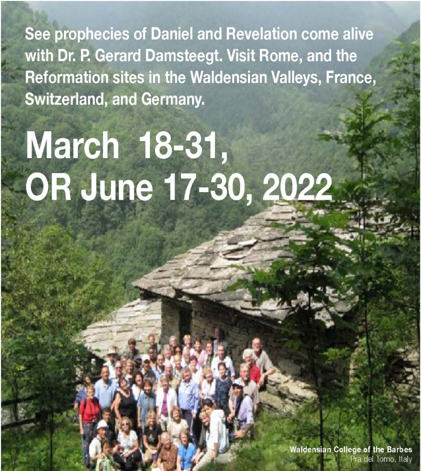
Waldensian College of the Barbes Pra del Torno, Italy