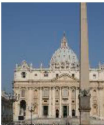
Vatican City Rome, Italy