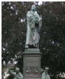
Luther Monument Worms, Germany