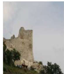
Castle of Canossa Canossa, Italy