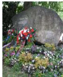
Huss's Martyrdom Site Konstanz, Germany